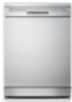
InAlto 60cm Freestanding Dishwasher Stainless Steel