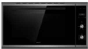
InAlto 90cm 10 Function Oven Programmable Timer