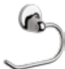
Toilet Roll Holder Chrome