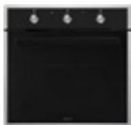
InAlto 60cm Fan Forced Oven Minute Timer