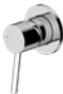
Mizu Drift Shower & Bath Mixer Chrome