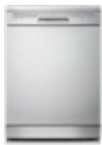
InAlto 60cm Freestanding Dishwasher Stainless Steel