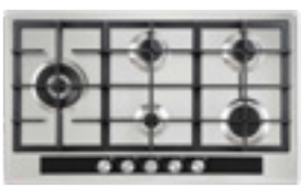
InAlto 90cm Gas Cooktop with Wok Burner