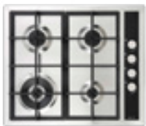
InAlto 60cm Gas Cooktop with Wok Burner