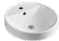
Round Vanity Basin