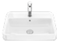
Roca The Gap Basin