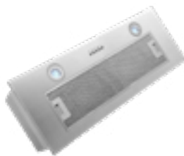
InAlto 90cm Undermount Rangehood