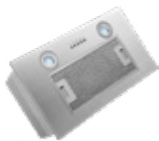
InAlto 60cm Undermount Rangehood