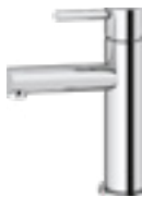
Mizu Drift Basin Mixer Chrome