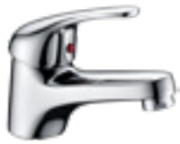
Basin Mixer Chrome