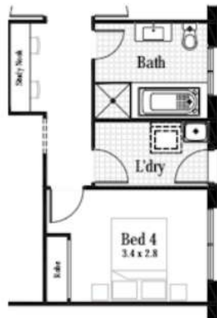
Option Bedroom 4 in lieu of living room