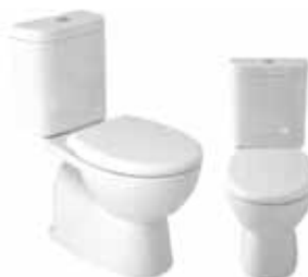
Toilet suite with soft close seat in white