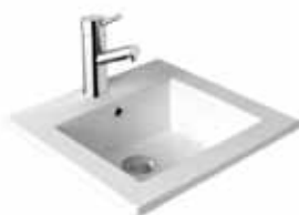
Ceramic basin - white