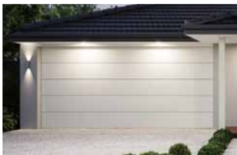
Remote controlled Colorbond® Sectional overhead garage door with 2 remotes