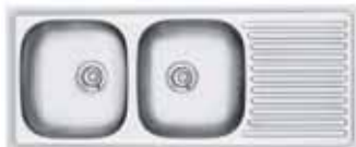
Double bowl sink