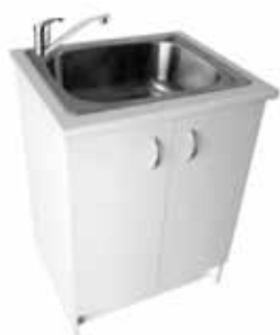
Laminated white cabinet with 45 litre stainless steel trough