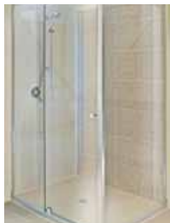
Executive shower screen tiled base