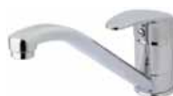
Sink Mixer - Chrome