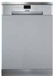
600mm dishwasher 12 settings, 7 programs