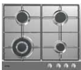
600mm cooktop 4 burner w/wok cast iron trivets