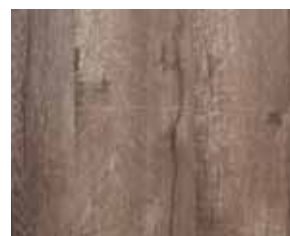
Bolero timber look laminate flooring