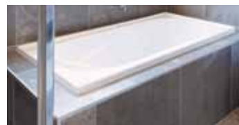
White acrylic bath