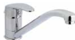
Basin Mixer in chrome