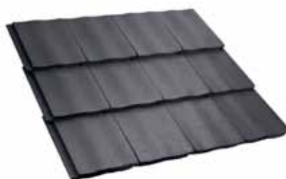
Monier Atura roof tile

The builder reserves the right to substitute the make, model or type of any of the above products to maintain the quality and product development of its homes. Changes may be made subject to Res Code requirements. Imagery for illustrative purposes only.