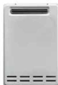
Gas continuous flow water heater system (estate specific. Will be used in estates where recycled water is available.)