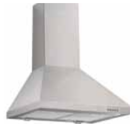
600mm canopy range hood