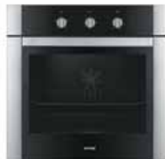
600mm electric fan forced inbuilt oven with manual timer