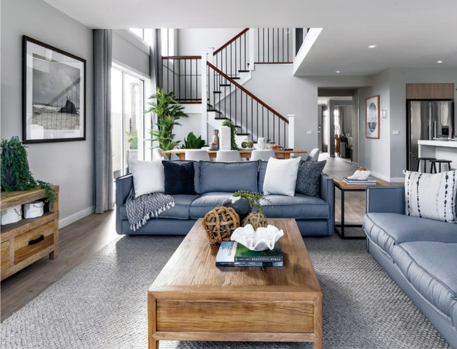
Porter Davis Savoy 40