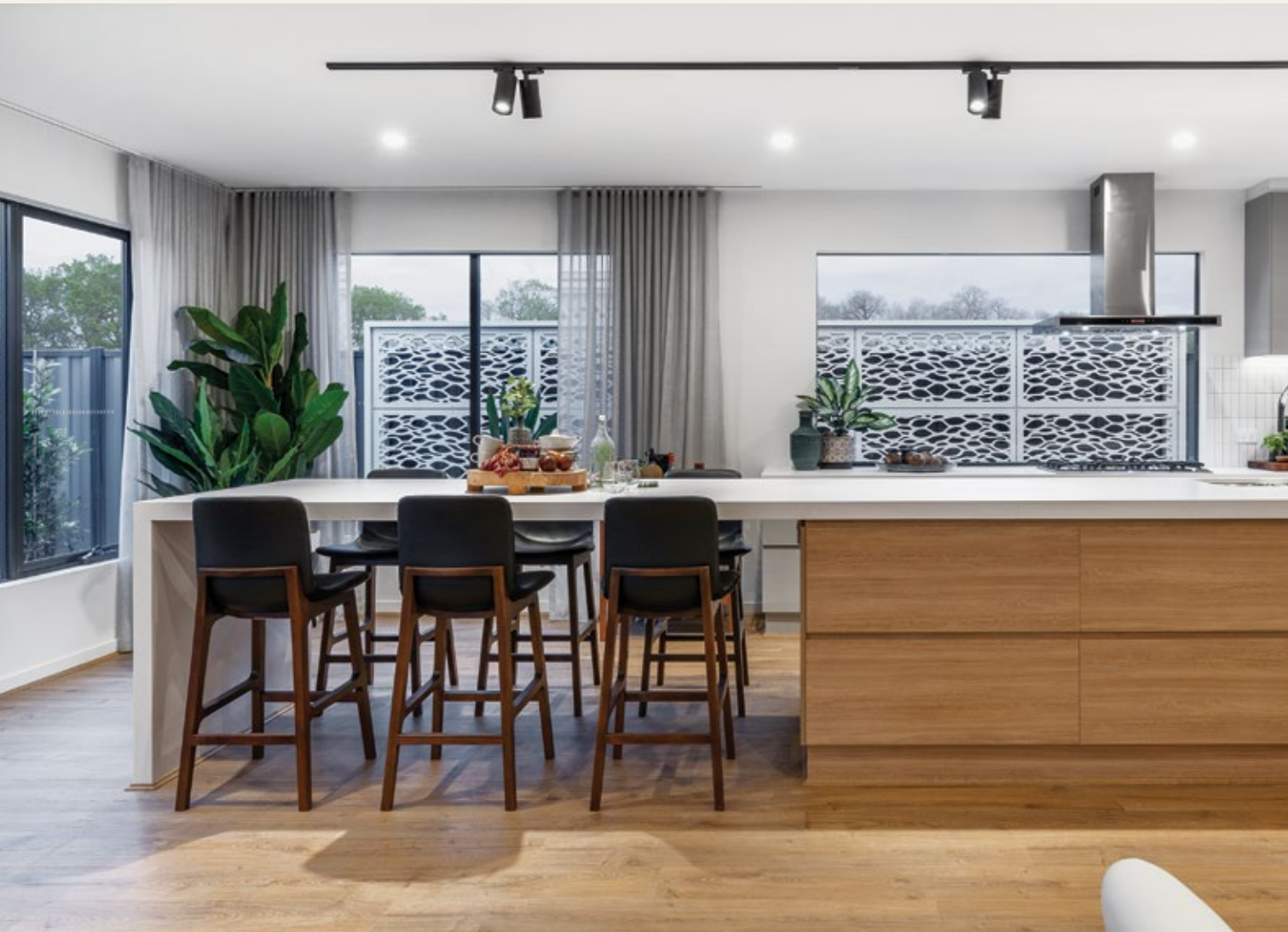
Porter Davis Yarra 33