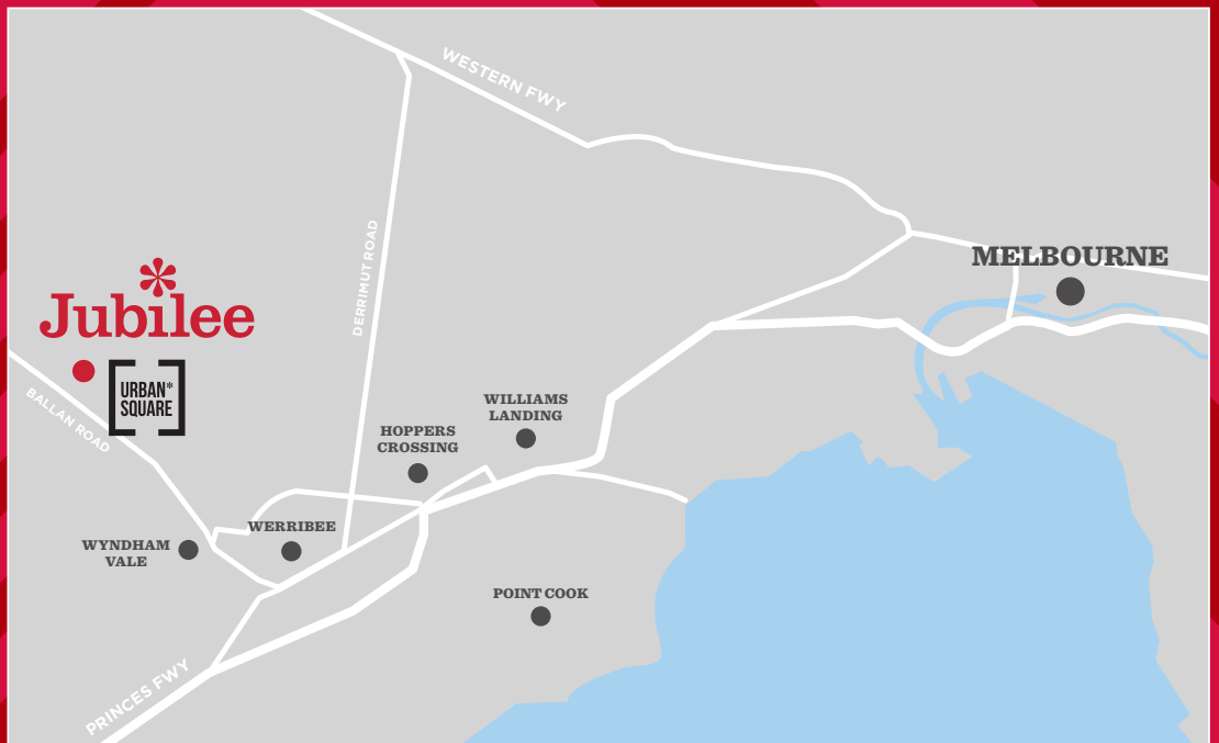
SALES AND INFORMATION CENTRE

Visit our Sales & Information Centre and discover the unexpected joys at Jubilee.