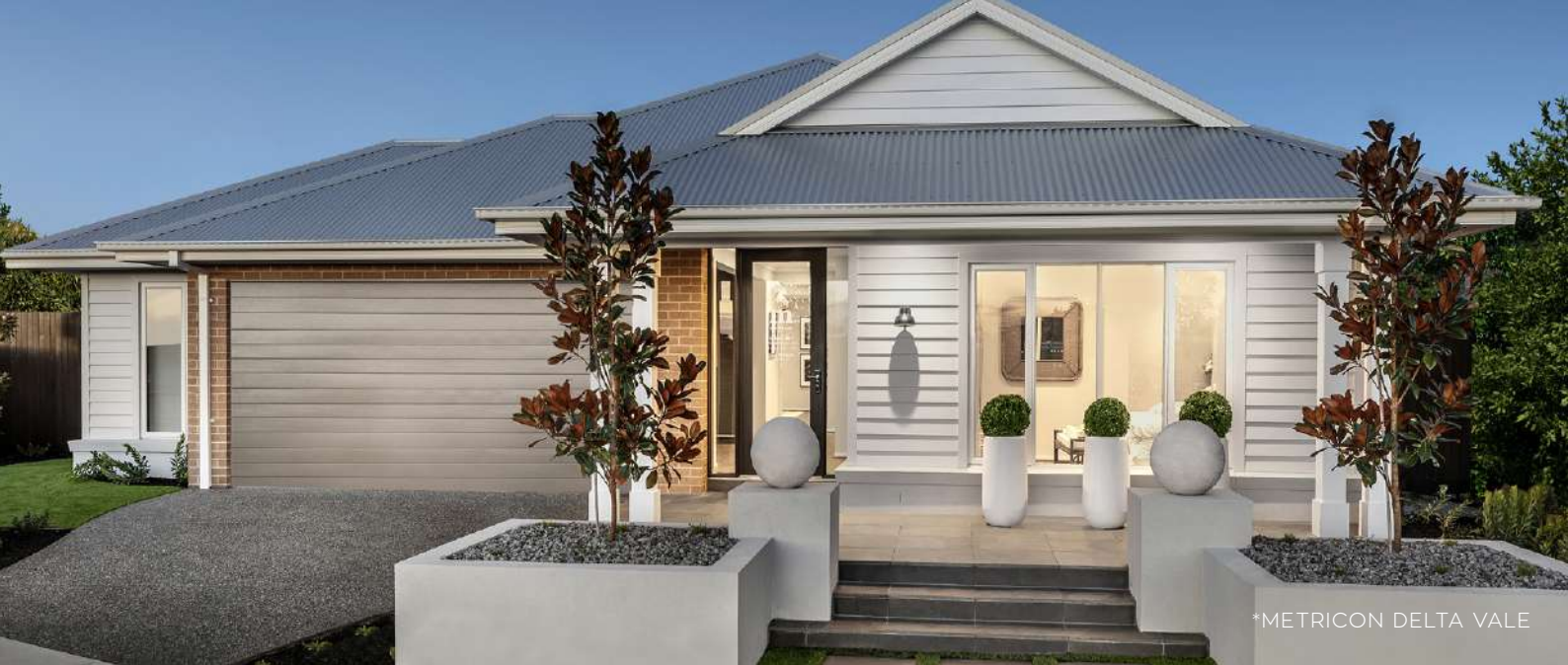
*METRICON DELTA VALE