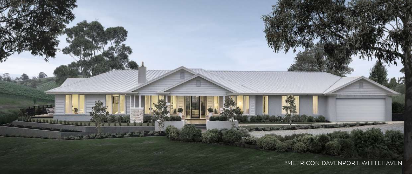
*METRICON DAVENPORT WHITEHAVEN