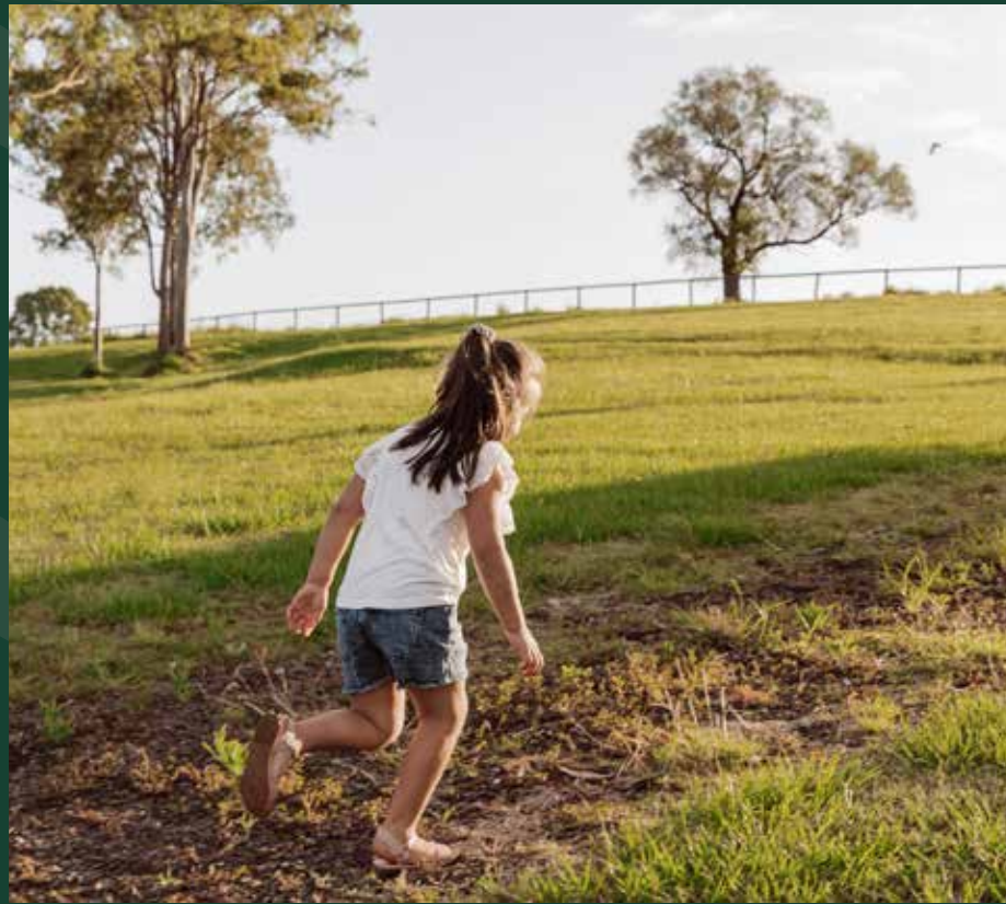
Glenlogan Lakes Park