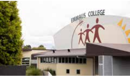
Jimboomba Central Shopping Centre & Emmaus College

A place where you can enjoy a quiet, family-oriented lifestyle embedded within tranquil surroundings. With only a short walk or drive from shopping centres, schools, parks and café's, Elridge offers easy access to all the facilities you need for everyday life.