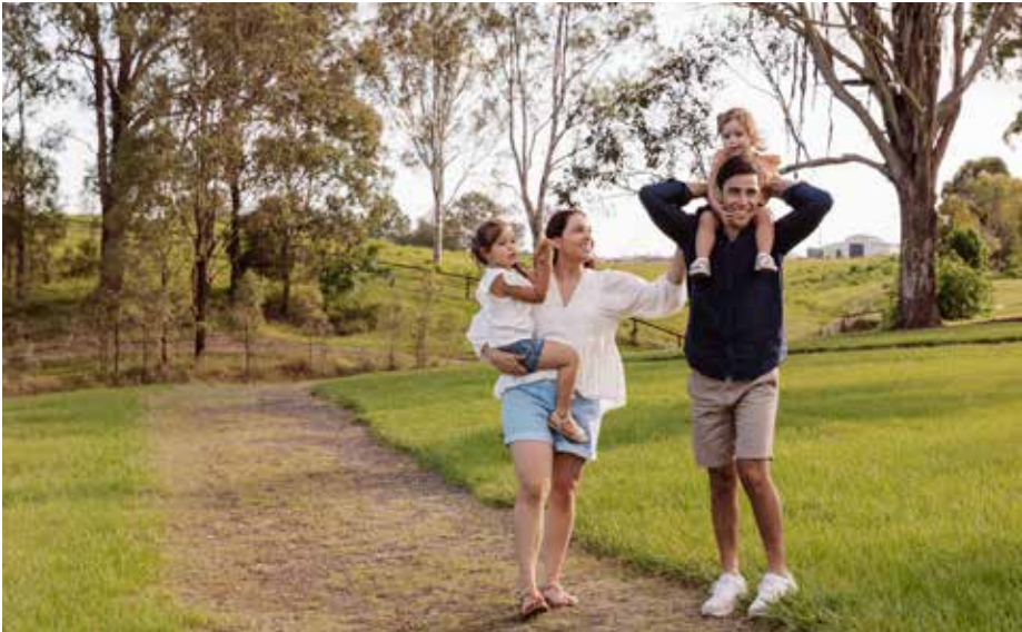
Glenlogan Lakes Park

Located in the heart of Jimboomba, Elridge is a carefully crafted community that brings together the best of rural tranquillity and city convenience.