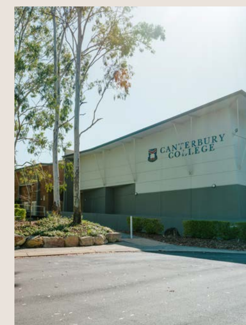
Images from left clockwise: Logan Village State School, Canterbury College, Griffith University Logan Campus, Loganlea Tafe.