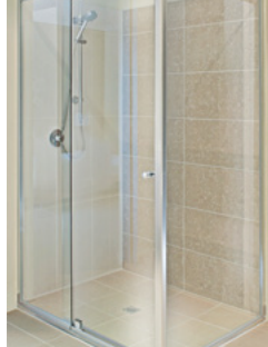
Executive shower screen tiled base