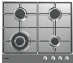
600mm cooktop 4 burner w/wok cast iron trivets