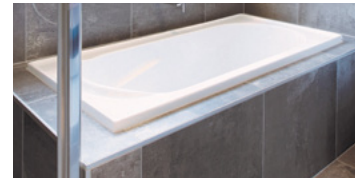
White acrylic bath