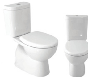
Toilet suite with soft close seat in white