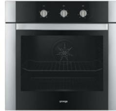
600mm electric fan forced inbuilt oven with manual timer