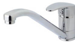
Sink Mixer - Chrome