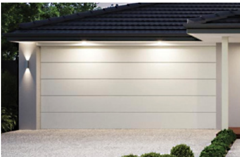
Remote controlled Colorbond® Sectional overhead garage door with 2 remotes