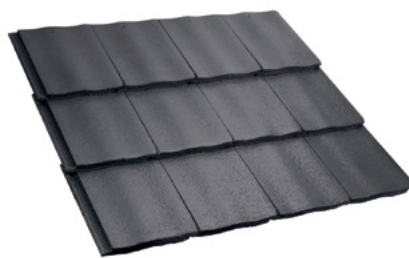
Monier Atura roof tile

The builder reserves the right to substitute the make, model or type of any of the above products to maintain the quality and product development of its homes. Changes may be made subject to Res Code requirements. Imagery for illustrative purposes only.