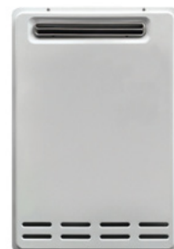
Gas continuous flow water heater system (estate specific. Will be used in estates where recycled water is available.)