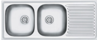
Double bowl sink