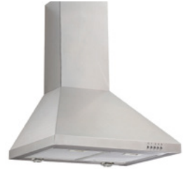
600mm canopy range hood