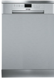
600mm dishwasher 12 settings, 7 programs