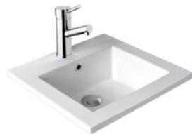
Ceramic basin - white