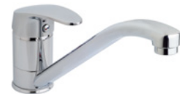
Basin Mixer in chrome