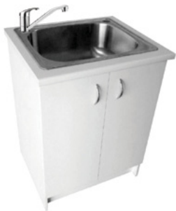
Laminated white cabinet with 45 litre stainless steel trough