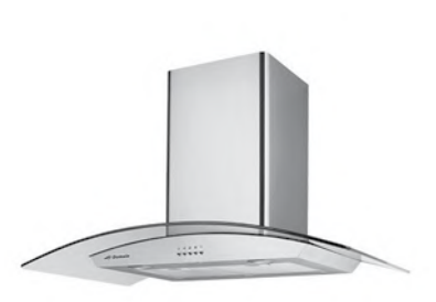
900mm Stainless Steel Canopy Rangehood