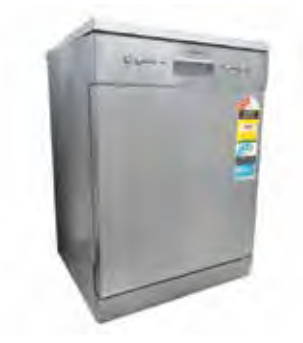
Stainless Steel Dishwasher