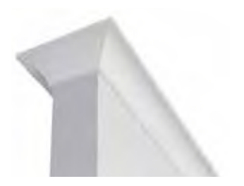
75mm scotia cornice