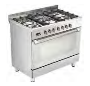
900mm Stainless Steel Upright Cooker