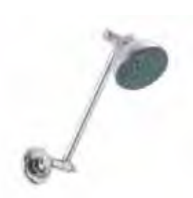
Shower straight arm