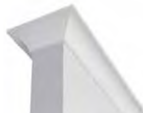
75mm scotia cornice