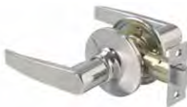
Internal lever door handles