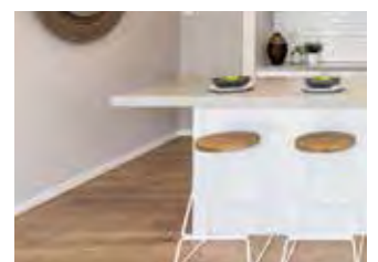
20mm Caesarstone Benchtops with 20mm Square Edge