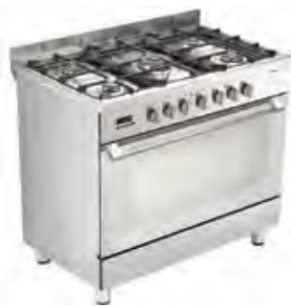
900mm Stainless Steel Upright Cooker