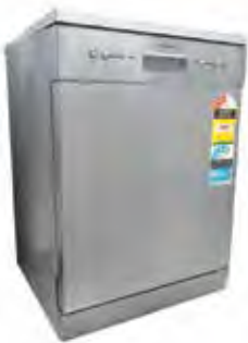
Stainless Steel Dishwasher

Domain Quality Appliances for Everyday Living