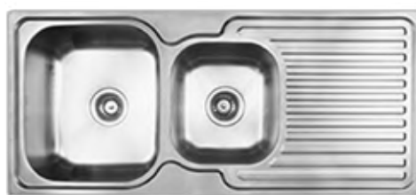
Stainless Steel Double Bowl Sink