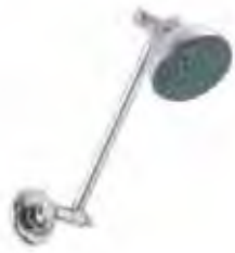
Shower straight arm