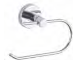
Toilet roll holder