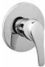
Shower mixer tap