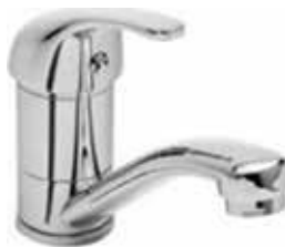
Basin mixer tap