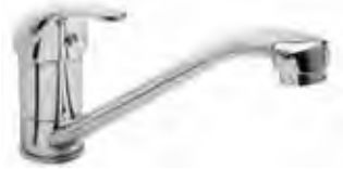
Laundry mixer tap