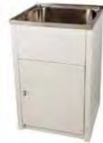
Laundry trough and cabinet