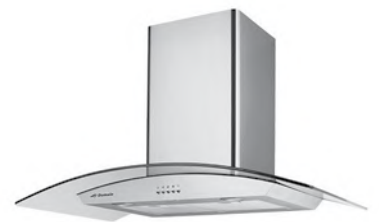
900mm Stainless Steel Canopy Rangehood