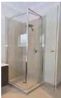
Semi-framed shower screen