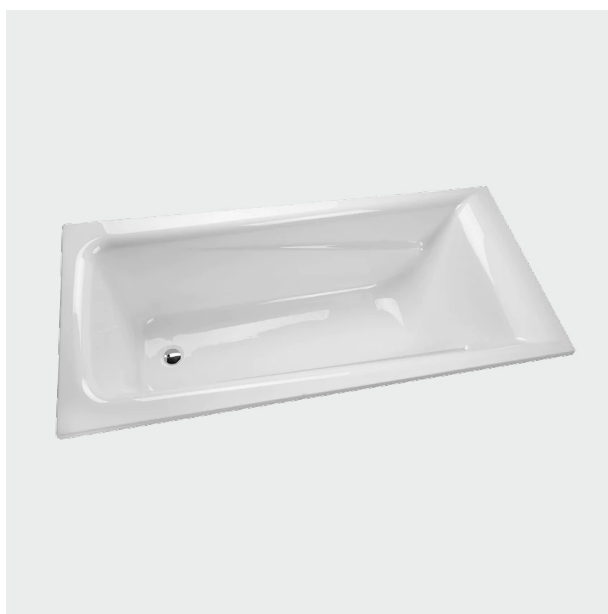
1 Bath Decina Novara (White) with Tiled Podium