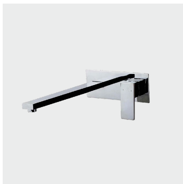
4 Bath Mixer Premium Wall Plate Bath Mixer