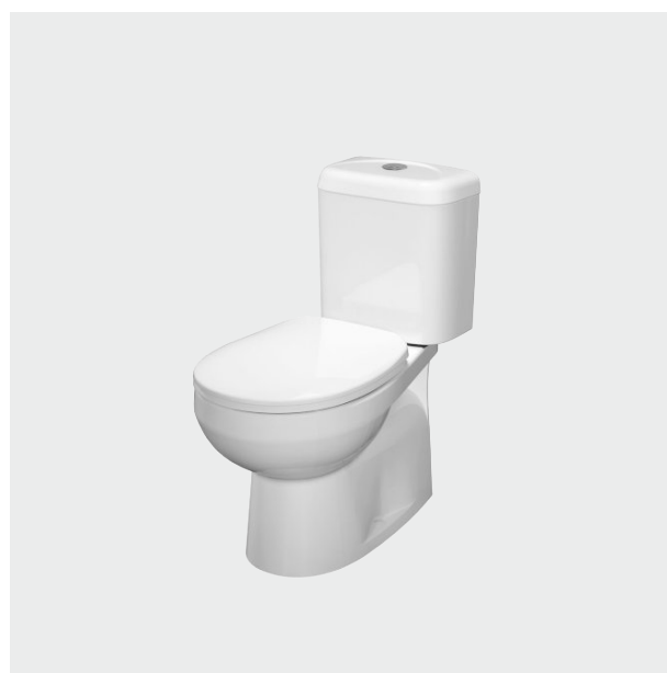
Toilet Suite Full Vitreous White.