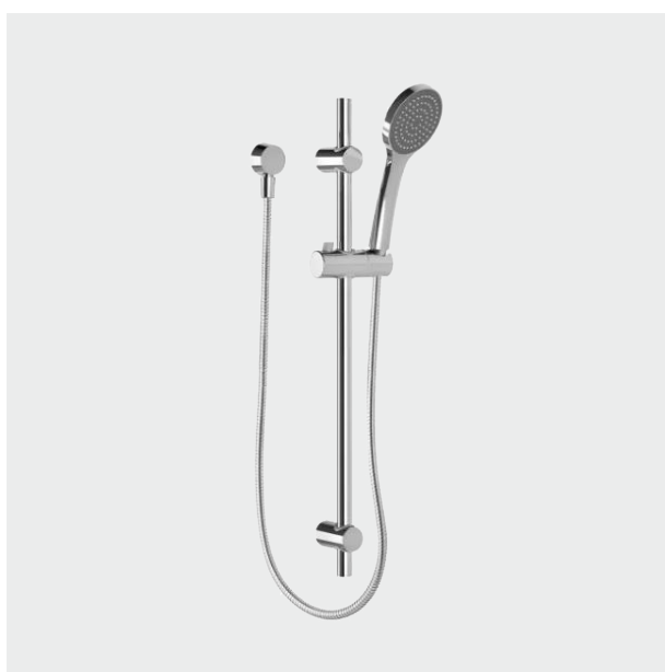
3 Shower Rose & Mixer Round Shower. Wall Plate Shower Mixer.