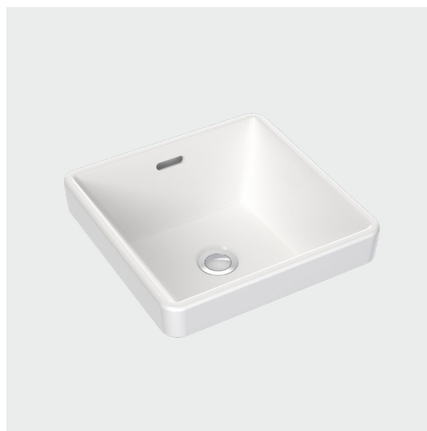
2 Vanity Basin Rectangular Basin White