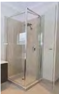
Semi-framed shower screen