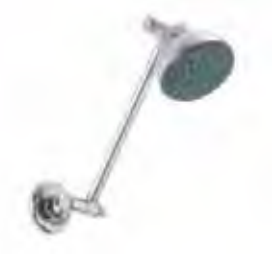
Shower straight arm