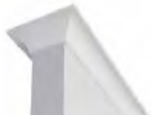
75mm scotia cornice