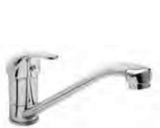
Laundry mixer tap