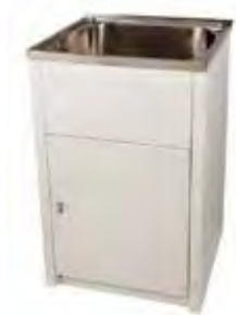
Laundry trough and cabinet