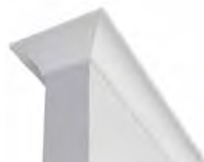
75mm scotia cornice