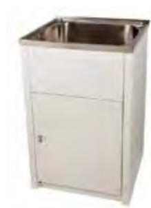
Laundry trough and cabinet