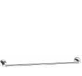
Single towel rail