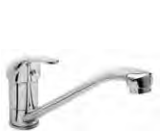
Laundry mixer tap