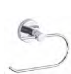
Toilet roll holder