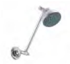
Shower straight arm