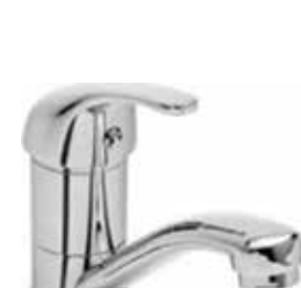
Basin mixer tap