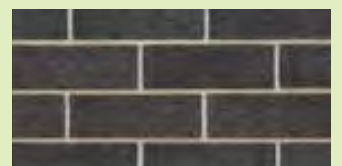
Natural colour mortar with rolled joints