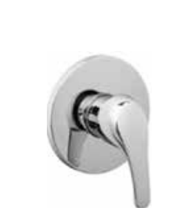
Shower mixer tap