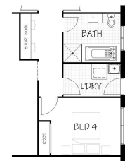
AZURE 19a OPTION