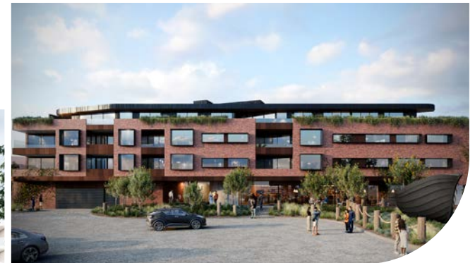
JOE'S QUARTER Mordialloc

Committed to using the best materials and latest technologies, Shenfield Property strives to achieve the highest standards of environmental and sustainable living. As with every project their build quality is second to none.