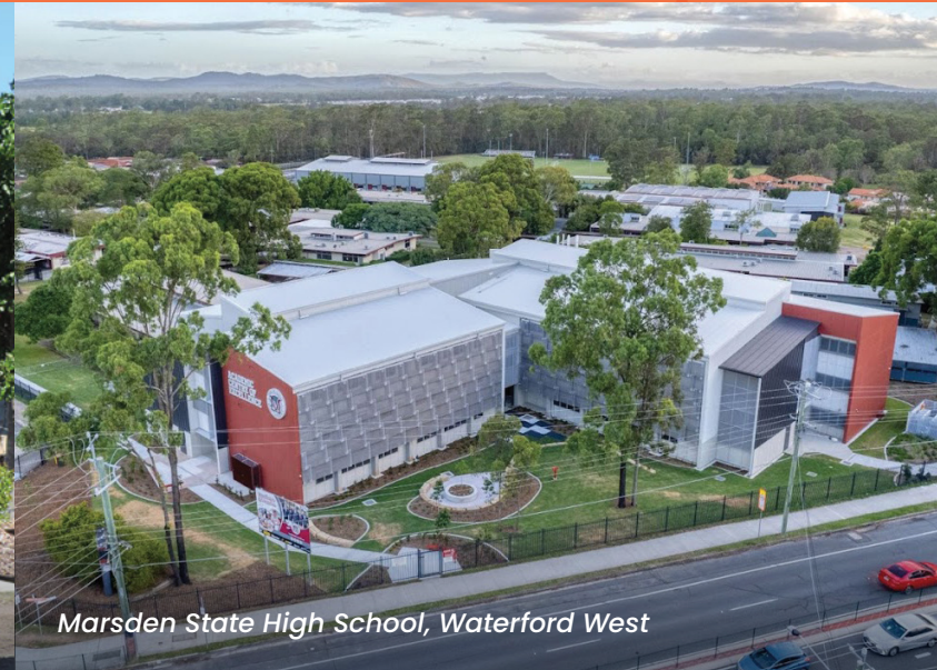
Marsden State High School, Waterford West