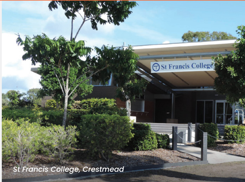
St Francis College, Crestmead

All of life's essentials are on the estate's doorstep, with seven medical facilities located within just a 10-minute drive, including Crestmead Medical Centre. Logan Hospital is only 15 minutes away providing residents with easy access to quality medical services. The hospital is currently undergoing a $460 million expansion to increase its capacity in line with the Logan region's rapid population growth.