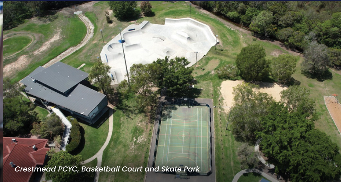
Crestmead PCYC, Basketball Court and Skate Park