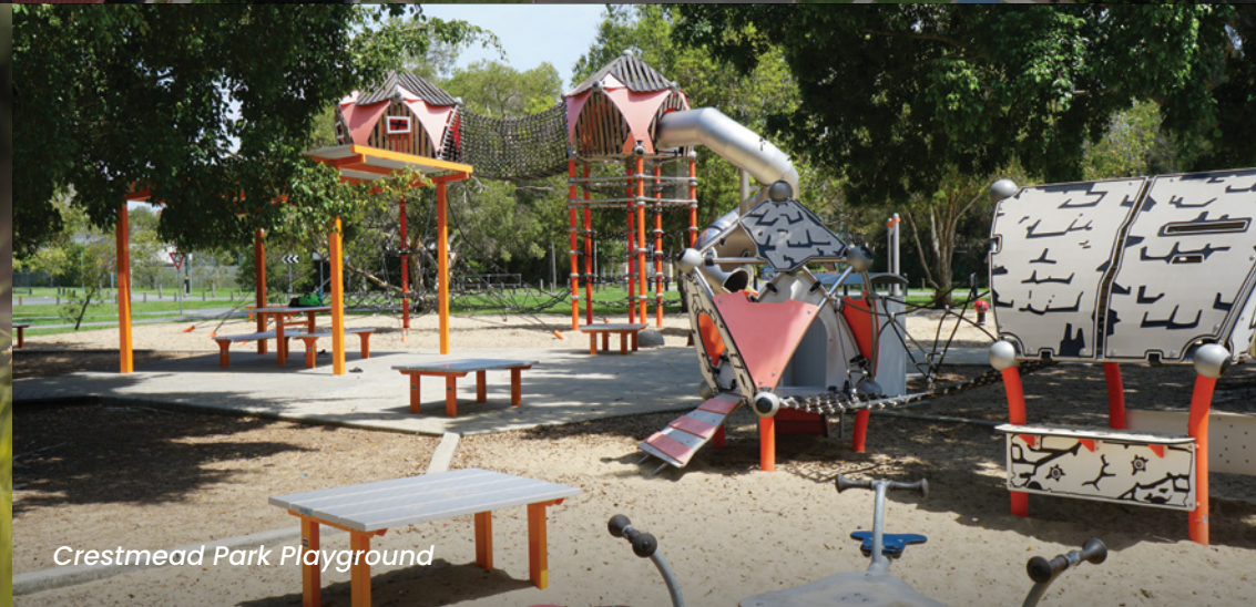
Crestmead Park Playground