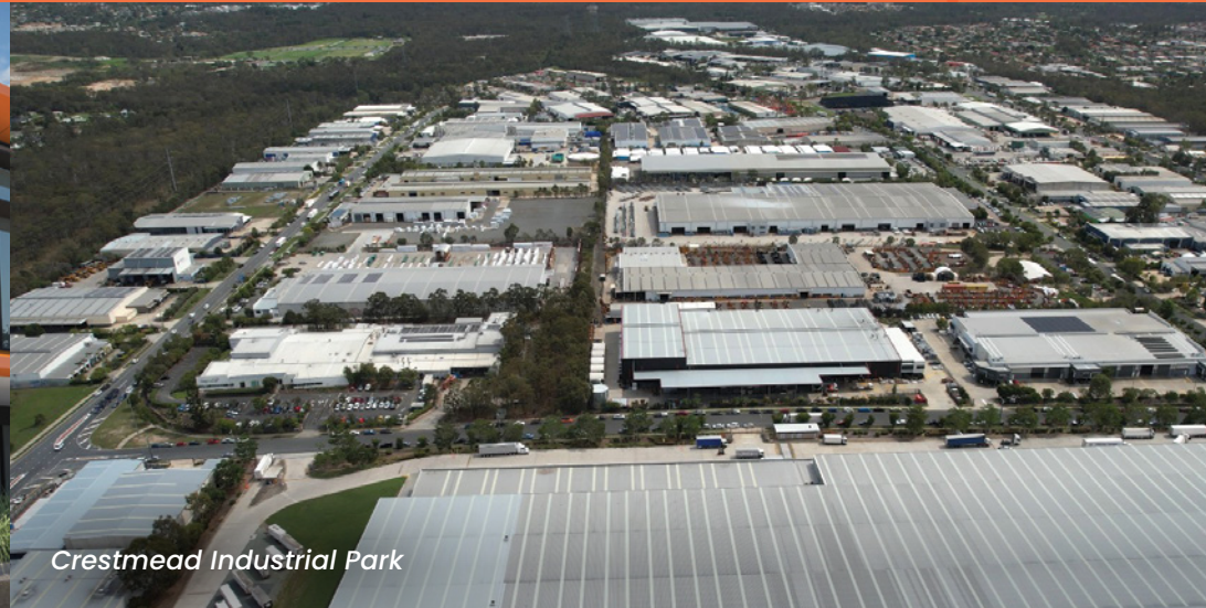
Crestmead Industrial Park