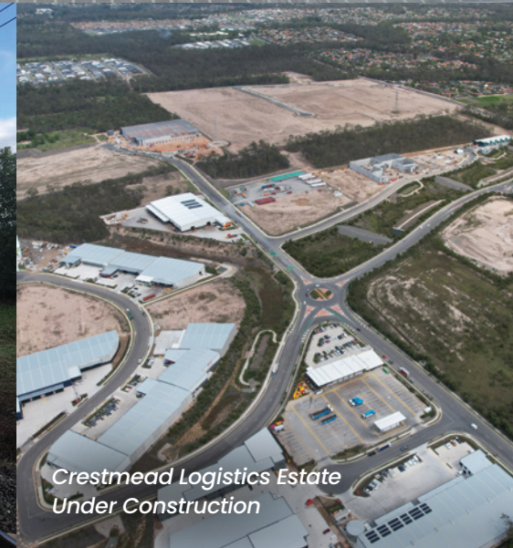
Crestmead Logistics Estate Under Construction