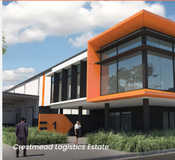
Crestmead Logistics Estate

Residents can also look forward to the PRC, a future transport link that will further connect development in the wider Park Ridge area to nearby centres like Browns Plains and Logan Central, allowing faster access to the Logan and Gateway Motorways.