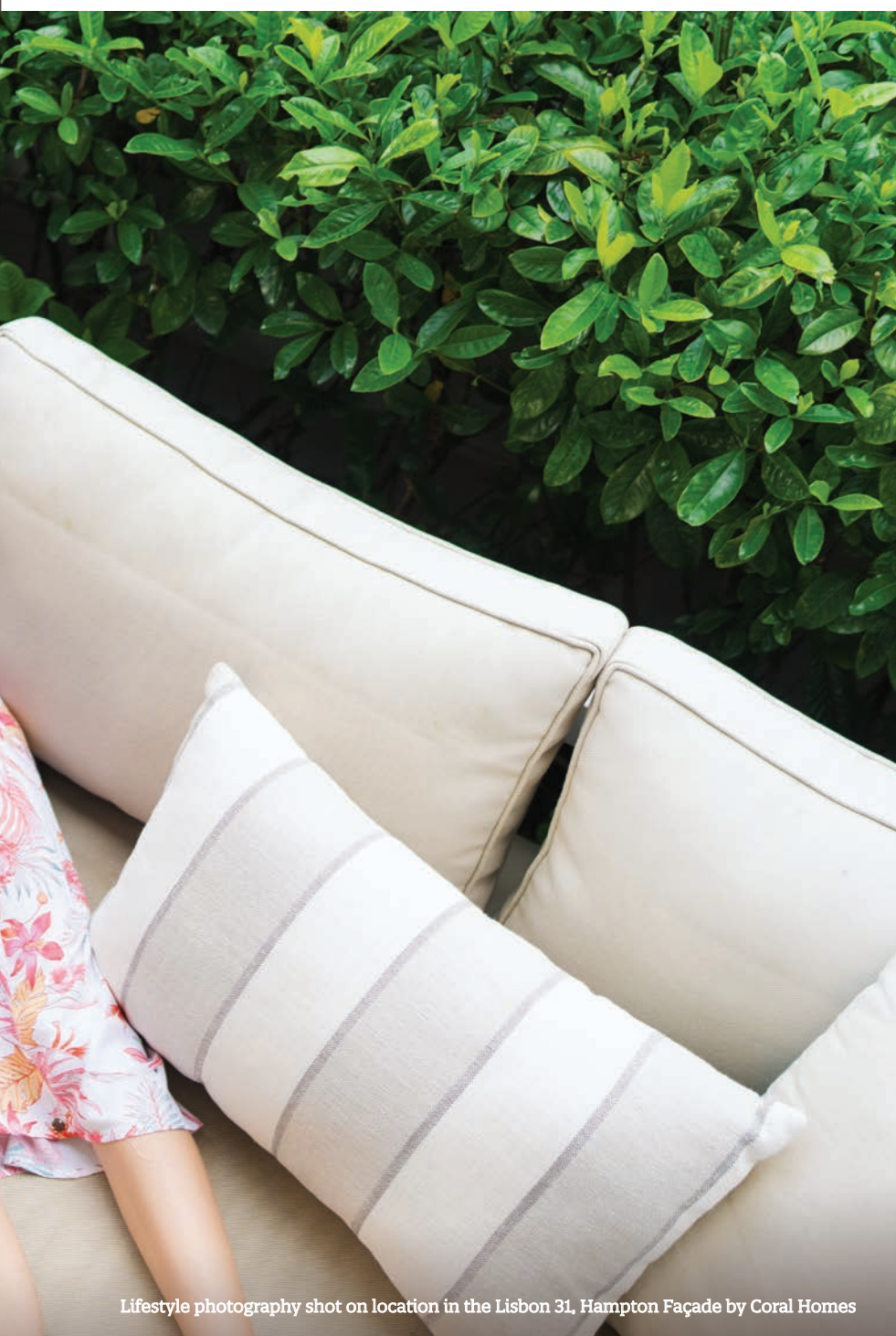
Lifestyle photography shot on location in the Lisbon 31, Hampton Façade by Coral Homes