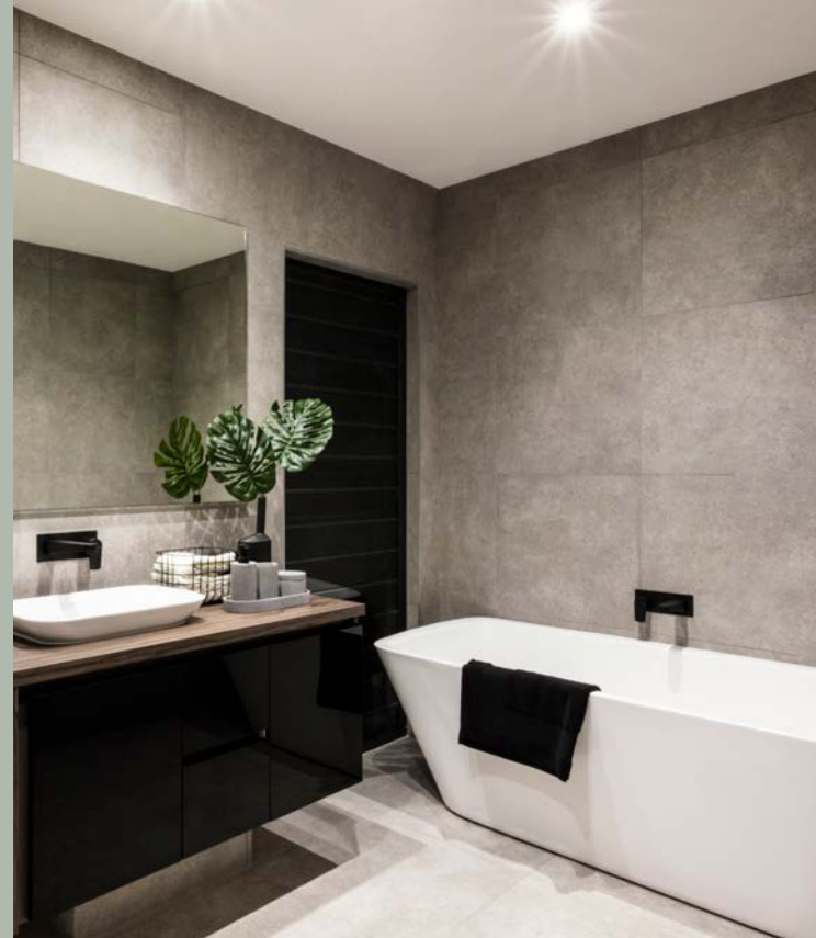
Bathroom bliss from Simonds Homes

Let yourself be transported to a natural oasis, where modern living is blended seamlessly with a natural lifestyle.