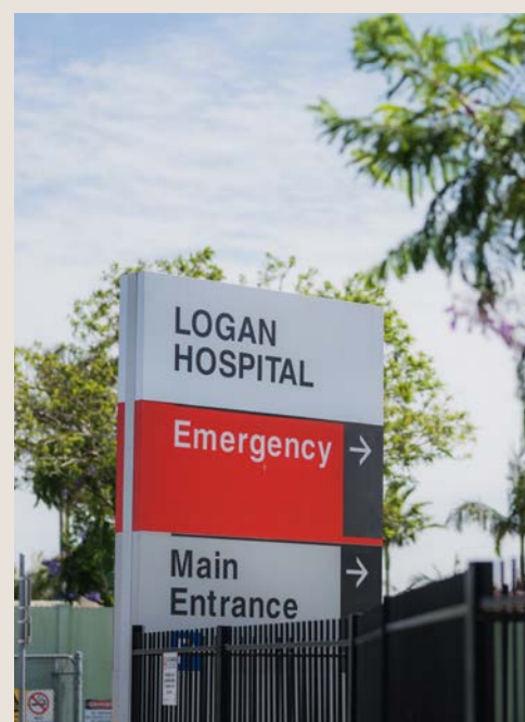
Images from left: Spend a day out on the green at Village Links, Logan Hospital.

The close-by further education campuses, such as TAFE and Griffith University, will continue to enrich your children's minds as they learn essential skills for future employment, putting them on the right path for their future.