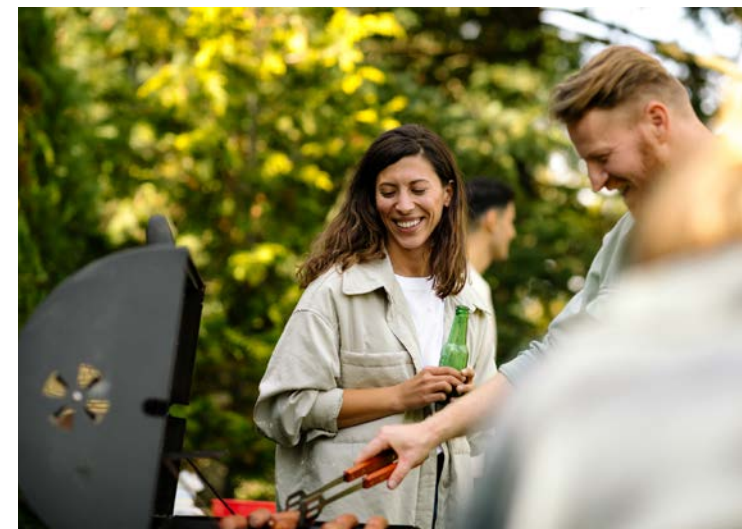
Bluegum brings families together

Saturday afternoons will be filled with fun and laughter as children play backyard cricket and parents enjoy long sunset barbeques – all centred around creating lasting friendships built over shared memories.