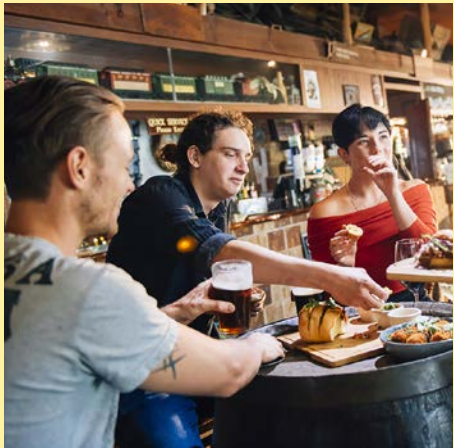
Clockwise from top: Take home some freshly baked bread from Country Bakery. Create a happy, healthy lifestyle for your family with fresh fruit and vegetables available locally. Enjoy the vibrant colours and unbeatable taste of fresh produce. Catch up with friends over a delicious meal at the Bearded Dragon. Albert St bus stop