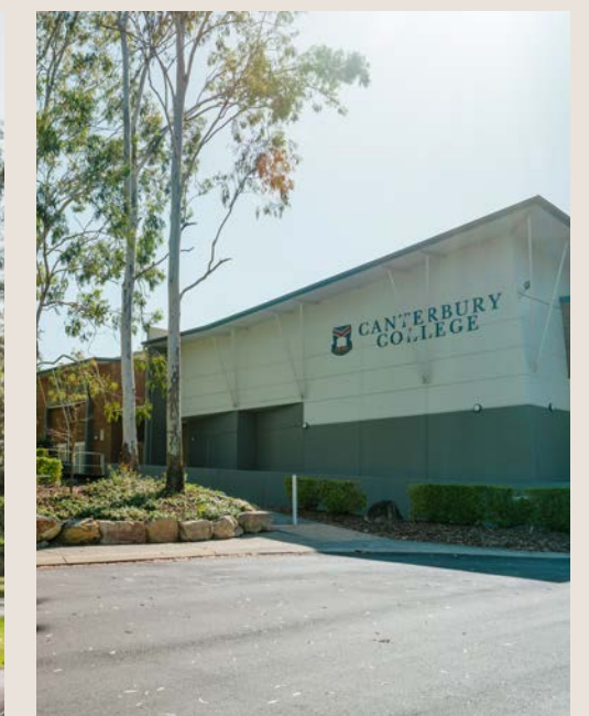
Images from left clockwise: Logan Village State School, Canterbury College, Griffith University Logan Campus, Loganlea Tafe.