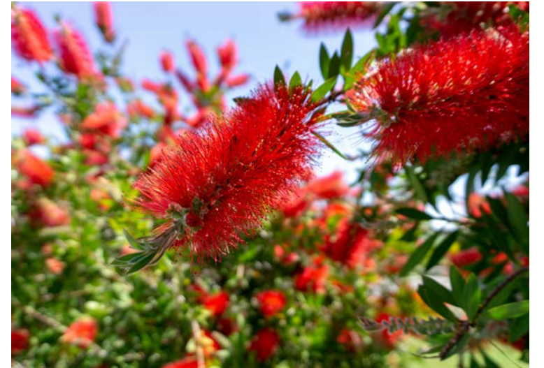
Stunning weeping bottle brush

With our sustainable approach to property development, we're crafting communities that are beneficial for both the environment and the people who call it home. By implementing dense natural landscaping in the bio-retention basin, we promote native landscapes and support diverse flora that preserve species and attract bird life.